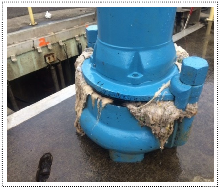
Wastewater Machinery Blockage