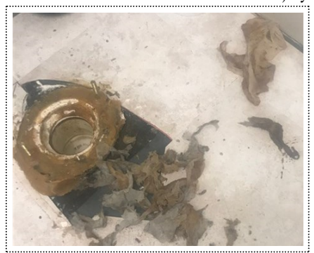
Homeowner Toilet Base