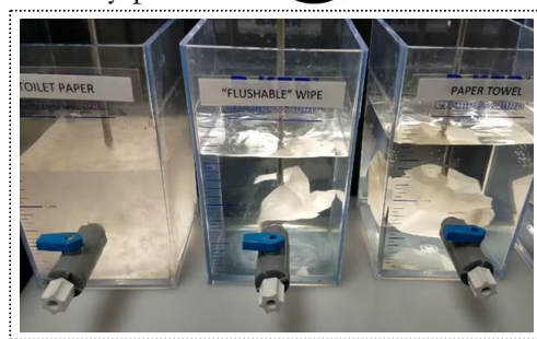
Toilet Paper / "Flushable" Wipe / Paper Towel Breakdown Comparison