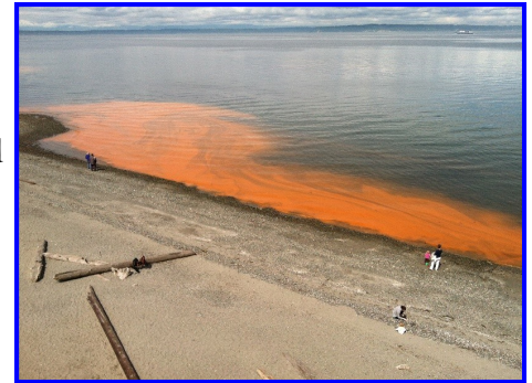
Noctiluca scintillans bloom at Saltwater State Park in Des Moines, WA.